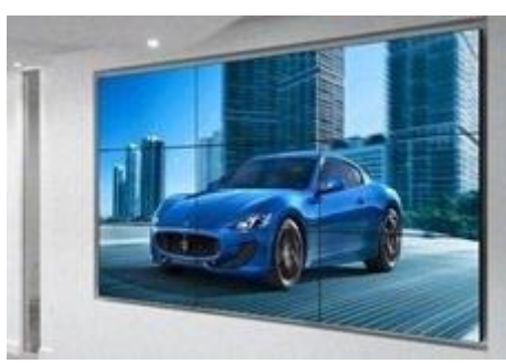
Video Wall Displays