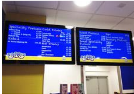
Professional LED Displays