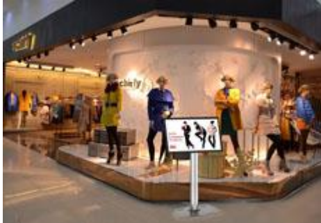
Media Player Monitors