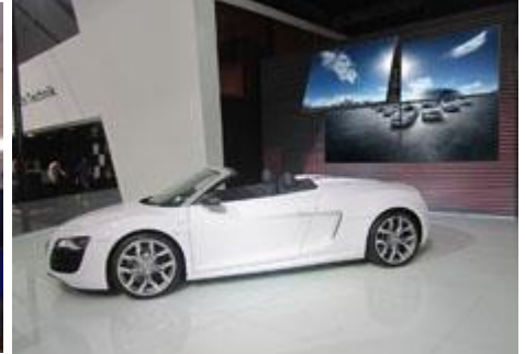
Video Wall Displays