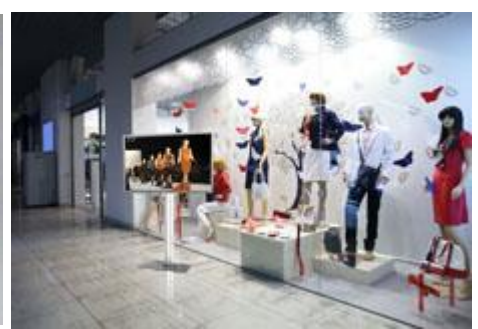
Touch Screen Displays

For full detail of these and all other products available from Hantarex please visit our web site at www.hantarex.com ; complete the enquiry form on the Contact Us page; e-mail: sales@hantarex.com or call Sales on 020 8778 1414