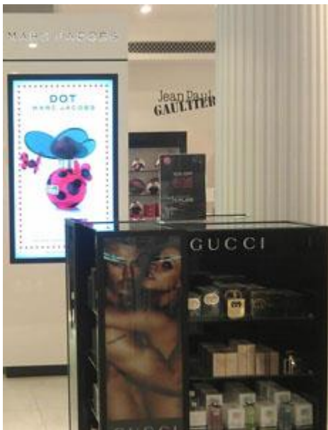
High Brightness Displays

At Hantarex we offer LED/LCD display products for every type of application including professional, digital signage, touch screen, video walls, media player and now networked monitors. We've been established in the UK for 35 years and have a reputation for supplying solid and reliable products. Innovation, quality and value for money are at the root of our business philosophy. Please contact us today for a competitive price quotation.