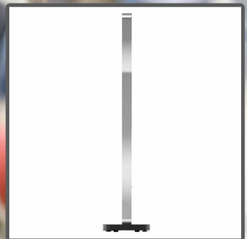
55" Slimline Freestanding Digital Poster